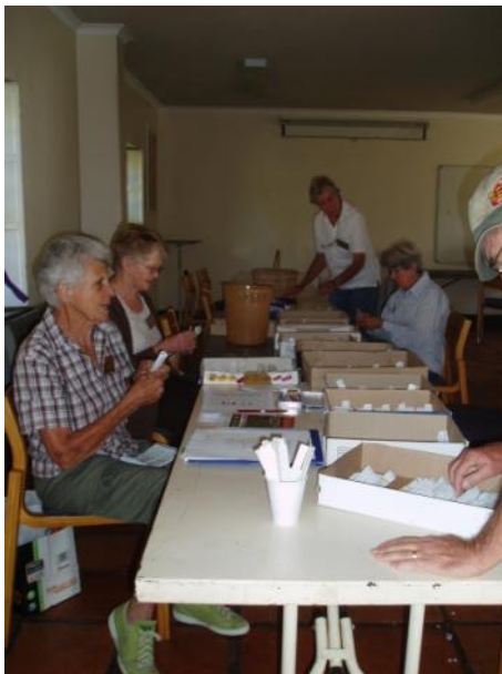
Volunteers preparing plant labels for the Garden Fair.