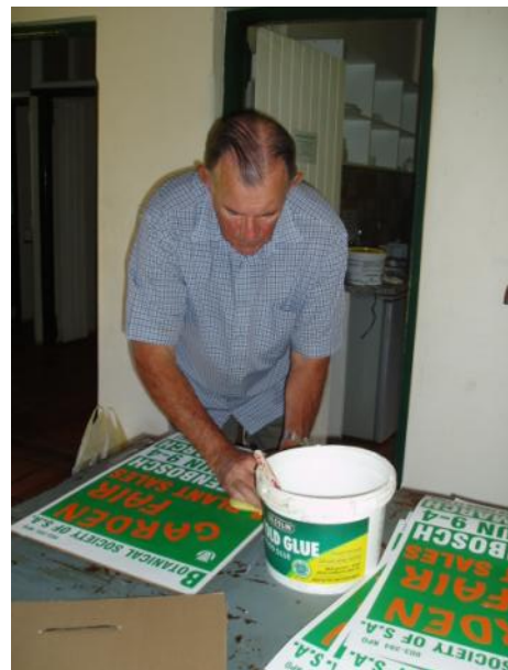
Volunteers preparing posters to advertise the Garden Fair.