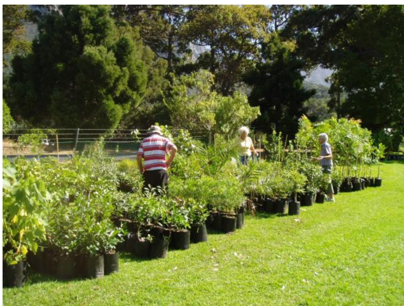
BotSoc Volunteers helping with the setup of the Garden Fair.